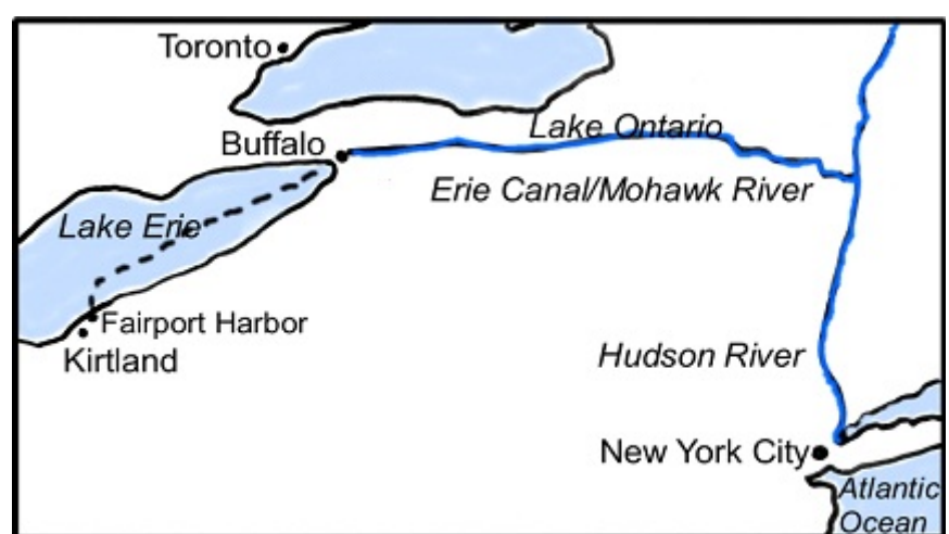
On June 13<sup>th</sup>, 1837, four of the British missionaries, accompanied by other missionaries, friends and family members, traveled 12 miles from Kirtland to Fairport Harbor, where they boarded a steamer for Buffalo. This route to New York City via the Erie Canal, rivers and train would cover 600 miles, but was much quicker than if they traveled the direct route 450 miles overland.

They were accompanied to Fairport Harbor by Vilate